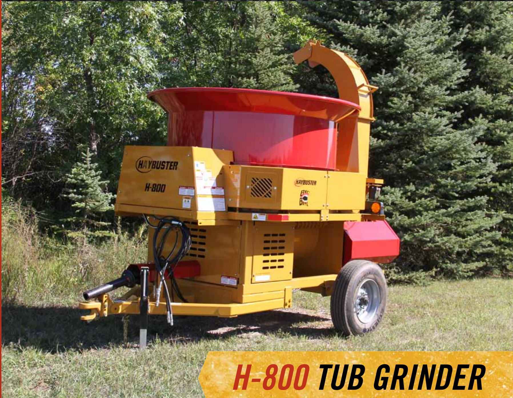
H-800 TUB GRINDER